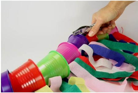
10. Punch another hole into a cup toward the end of the dragon's body. (About 4 th from the end)