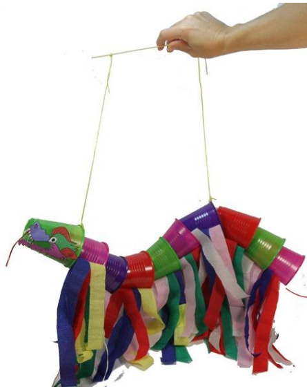
11. Attach string from the holes to either end of the stick. Use the stick to manoeuvre the dragon puppet.